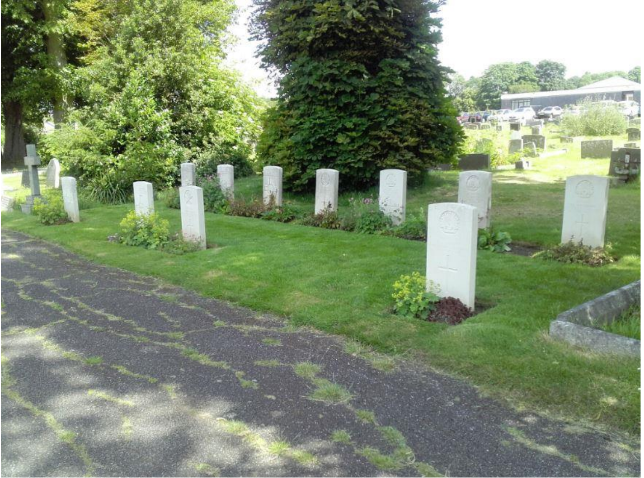
Grantham Cemetery – Australian Plot