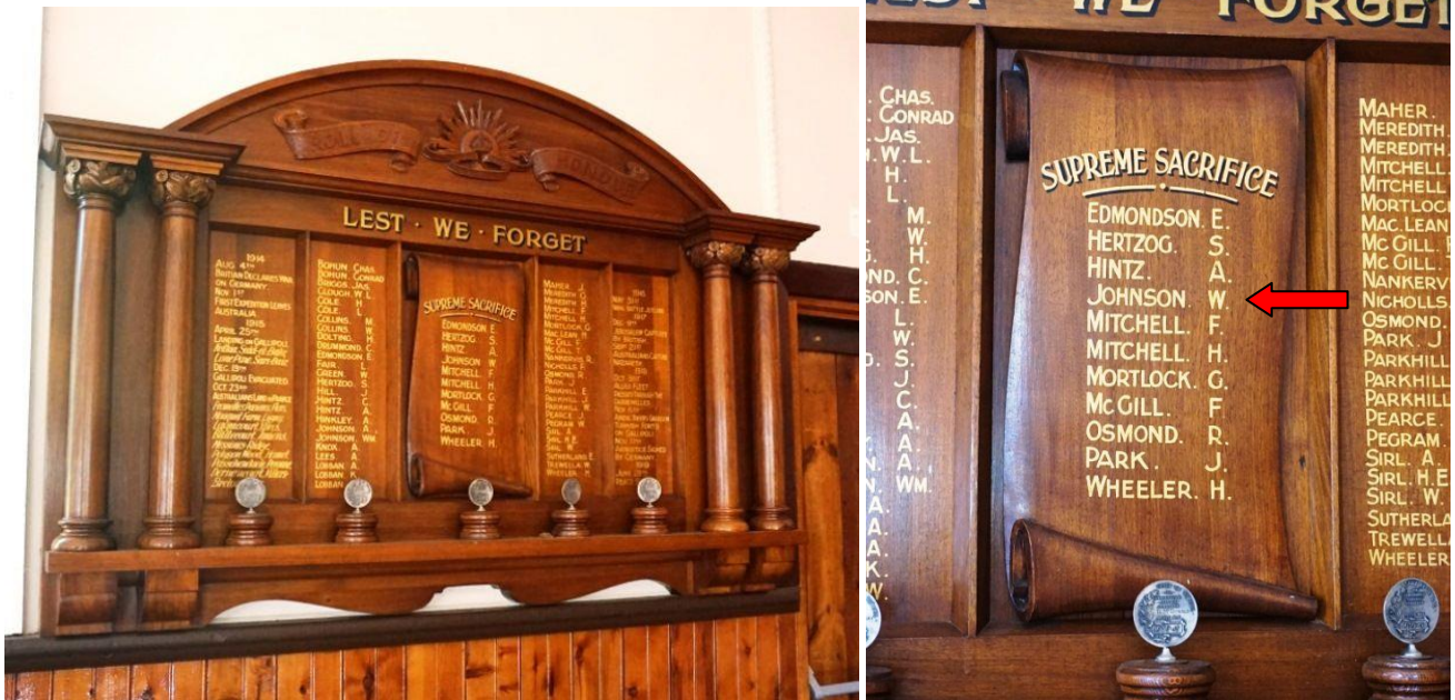
Bethanga Roll of Honour