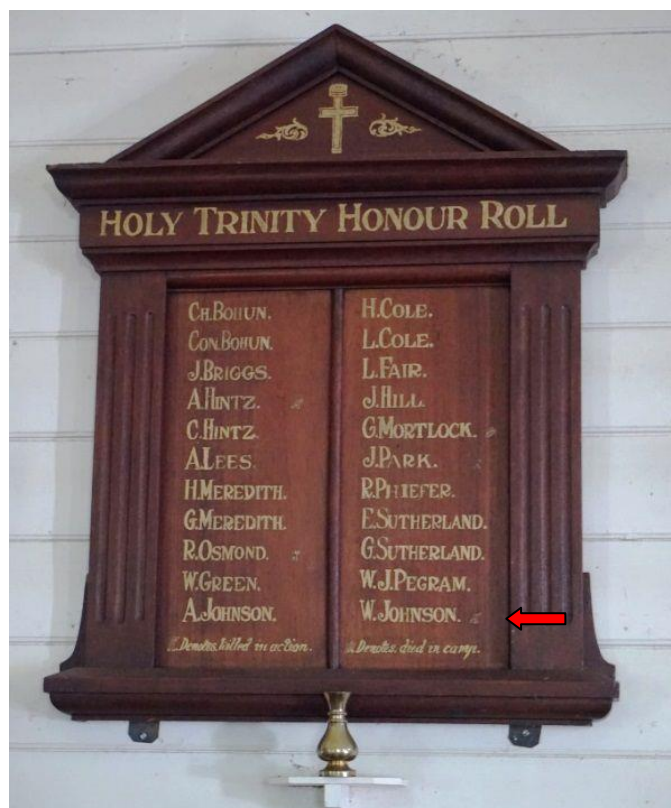
Holy Trinity Honour Roll